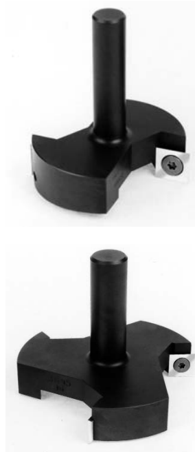
Figure 2. These spoilboard surfacing cutters are used for surfacing MDF, particleboard and balsa core where “flow through” or “high flow” cutting is employed using large capacity vacuum pumps.

smaller parts can become problematic with this spoilboard approach and other techniques should be employed to avoid part movement. Tab cutting and skin cutting techniques are especially effective in dealing with small parts. This involves leaving a tab or a thin layer of material on the bottom of the part to hold them together. The tab or skin portion is then removed in a secondary operation. This process is slightly more time consuming, but the final results are quality edges and less scrapped parts caused by movement during the machining process.