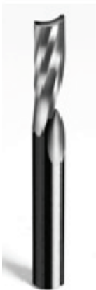
Single Edge Spiral "O" Flute

Generally speaking, plastic can be categorized as either hard or soft plastic. Soft plastic will curl a chip and hard plastic tends to produce a splintered wedge, which is actually broken off in the machining process. The use of "O" flute tools in straight and spiral configuration with high rake angles and low clearance will aid in eliminating the knife marks associated with soft plastic. Hard plastic is best routed with double edge "V" flutes, spiral "O" flutes with hard plastic geometry, or two and three edge finishers. These tools along with the proper chipload produce a crater free finish. Cratering in hard plastic occurs when the shear strength of the material is exceeded in the routing process.